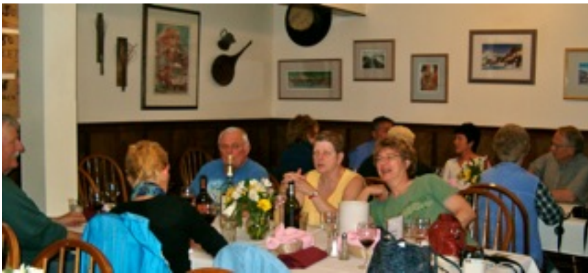
Dinner at the Kennicott Lodge Saturday evening. The prime rib was great!