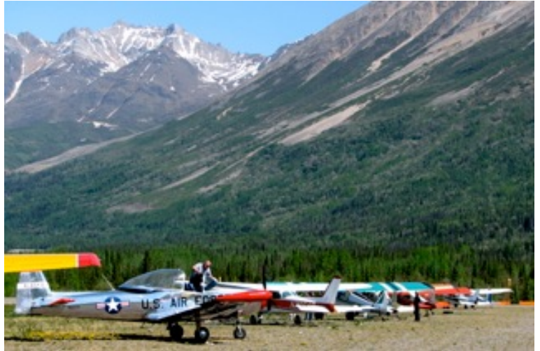
Some of the airplanes participating in the fly-in at the McCarthy Airport.